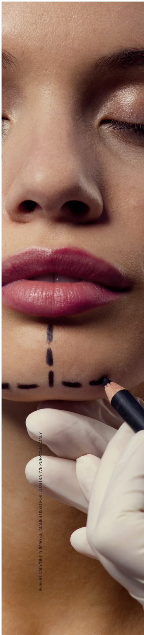
IMAGES USED FOR ILLUSTRATIVE PURPOSES ONLY